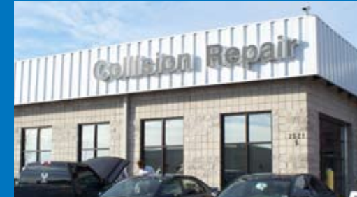
State Of The Art Facilities & Equipment

Free Estimates! We Repair All Makes & Models Foreign or Domestic!